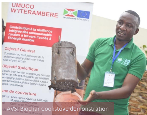
AVSI Biochar Cookstove demonstration