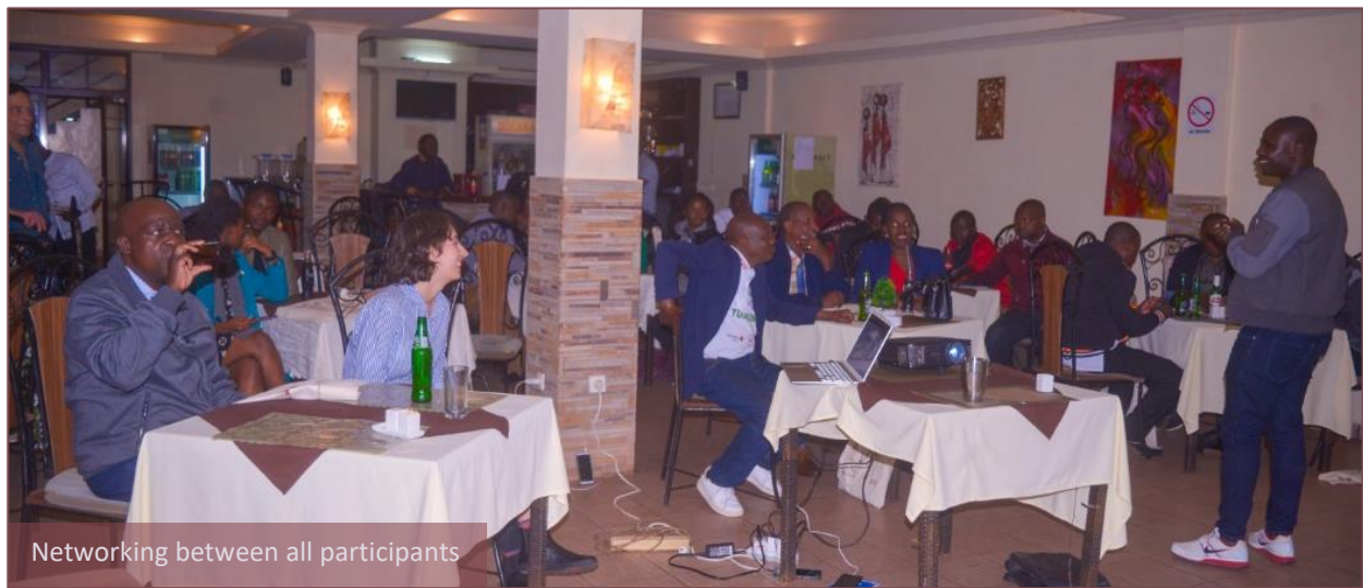
Networking between all participants